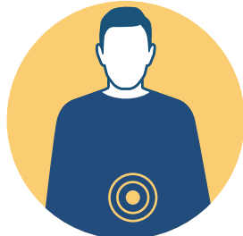
NAUSEA OR VOMITING