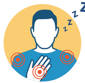
MUSCLE PAIN AND FATIGUE